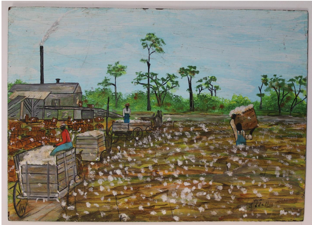
Item No. 1

https://www.lesserbooks.com/images/upload/catalog-201.pdf